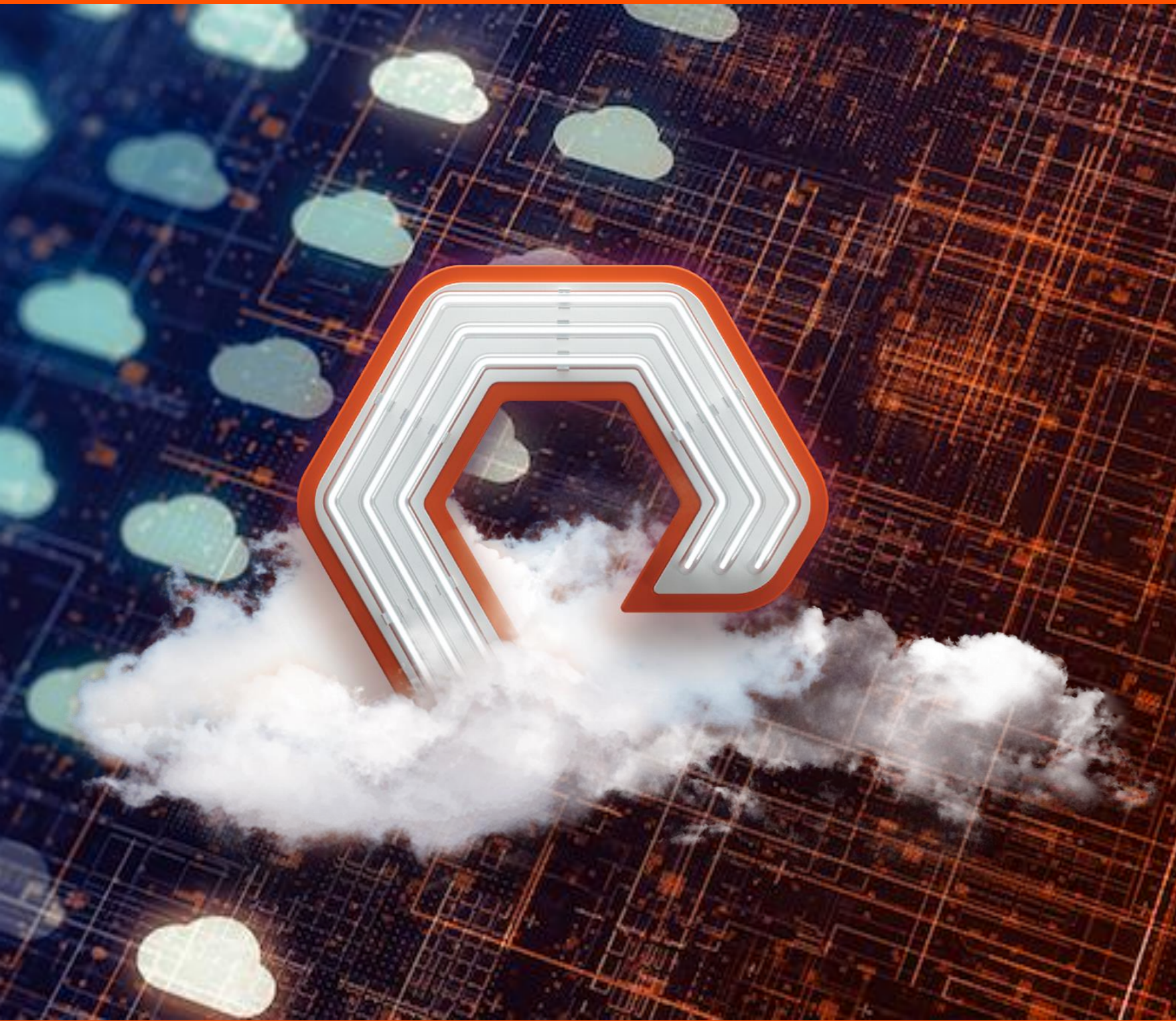
Cloud Operating Model